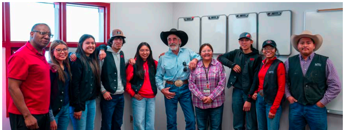
Forrie J. Smith, a renowned actor, stands with the NTU Rodeo Team inside the SUB building as he offers valuable insights.