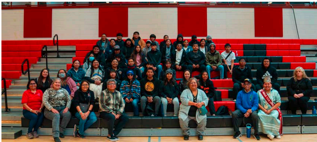
NTU staff, faculty, and students met with two significant high schools from Arizona inside the Wellness Center, Crownpoint, NM.