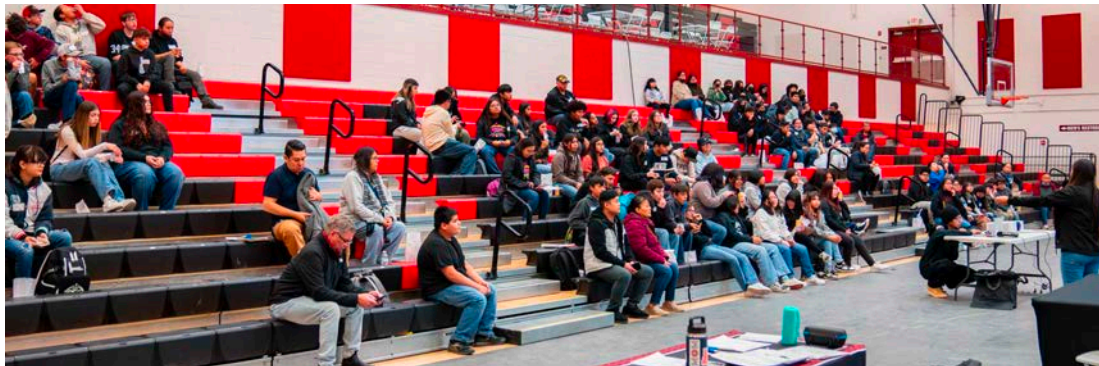
143 students from 7 middle schools enjoy a brief presentation from NTU staff and faculty inside the Wellness Center.