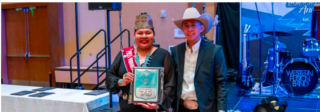
Miss NTU receives award for continuous support toward the Navajo Nation Fair, at Twin Arrows, Flagstaff, AZ.

Initially established for harvesting, gathering, and showcasing the talents of the Diné People, the Navajo Nation Fair has evolved into a significant event that reflects the vibrant Navajo government and communities. The success of the 75th Navajo Nation Fair sets the stage for an even more significant 76th Navajo Nation Fair in 2024.