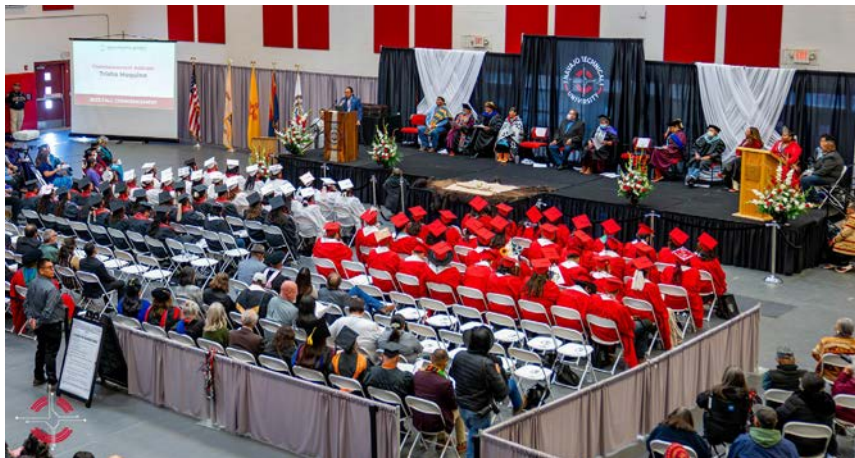
Navajo Technical University Fall Commencement 2023 held inside the Wellness Center in Crownpoint, NM