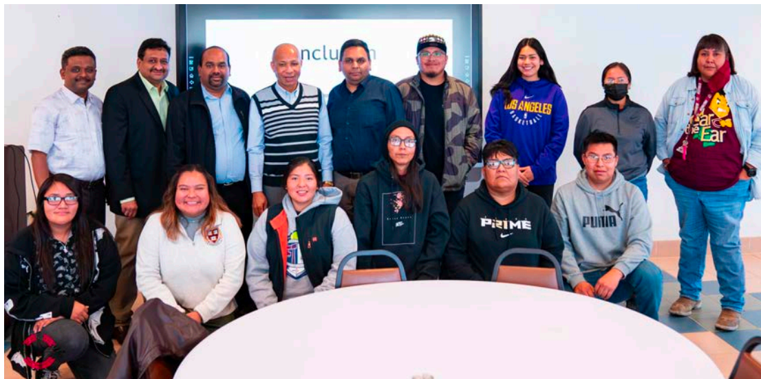
NTU Students, Deans, and professors pose with presenters from Washington State University and SRMIST, TN, India inside the Hospitality Center.