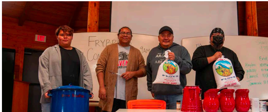
NTU Students and faculty competed in shaping, mixing, rolling, and cooking frybread inside the NTU Hogan.