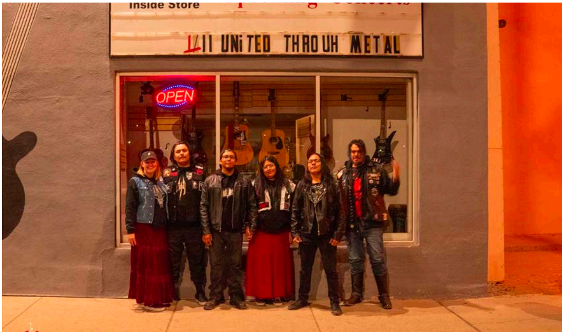
“United through Metal” at the Juggernaut, Gallup, NM sponsored by SkillsUSA and NTU.