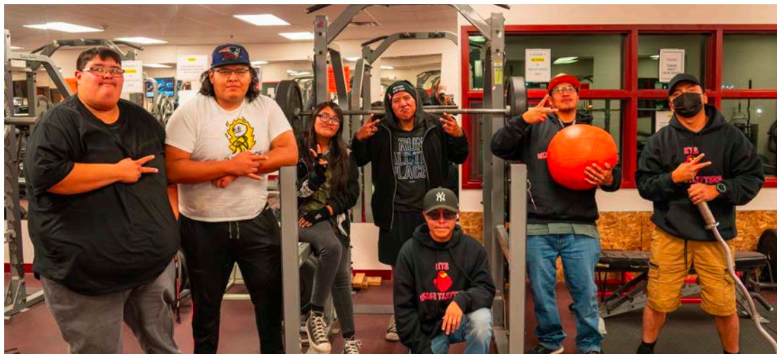
NTU's Weightlifting Club officially held it's first meeting inside the Wellness Center, Crownpoint, NM.

Navajo Technical University provides an excellent educational experience in a supportive, culturally diverse environment, enabling all community members to grow intellectually, culturally, and economically.