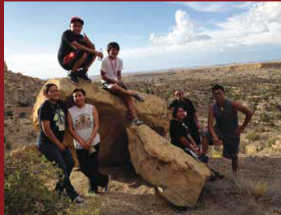
Hiking and nature walks are some of the many activities provided to first year students during orientation.