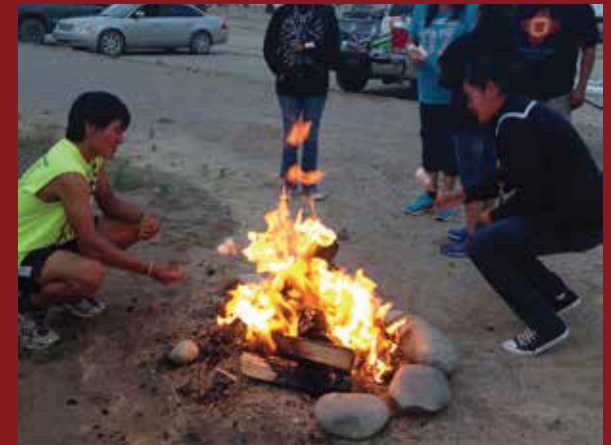
FYE students roast marshmallows during orientation week.