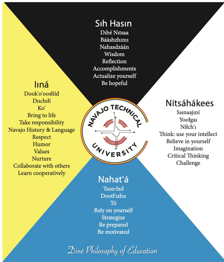
FIGURE 1: Diné Philosophy of Education at Navajo Technical University

met, and program improvements to be implemented in the future on the basis of that analysis (again, see Appendix 1 ).